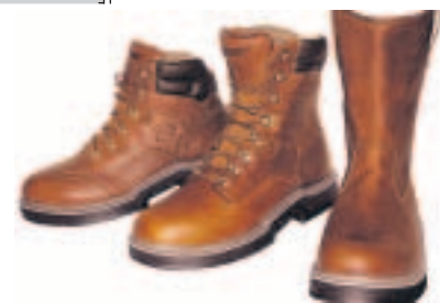
Roebuck and Co.

Cost: $129 to $159 Design: Leather boots with contoured section along arch, to be more flexible Created: In Rockford Produced: In Guangzhou, China Available: Early 2008 At: Track 'n Trail stores, Sears